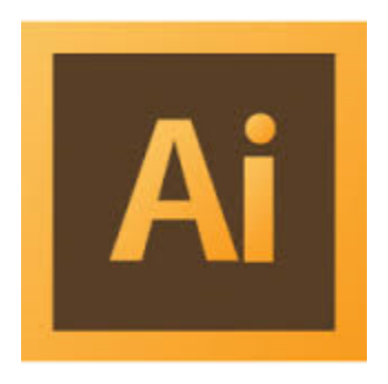
Illustrator Logo 1

A personal copy of Illustrator CC will be needed. You can download the 7 day free trial to get started. Eventually you'll need to lease or buy Illustrator CC. You can lease Illustrator CC for $19.99 per month on www.adobe.com on the Students and Teacher plan. This option comes with the entire Adobe Suite and includes Illustrator.