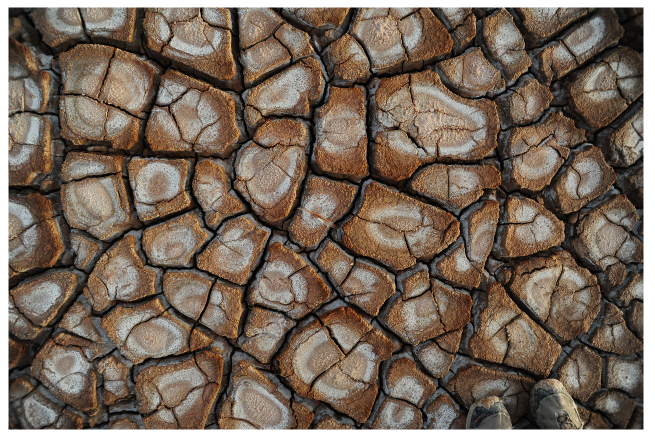
Geology 100: Physical (or General) Geology