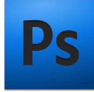
Photoshop Logo 1